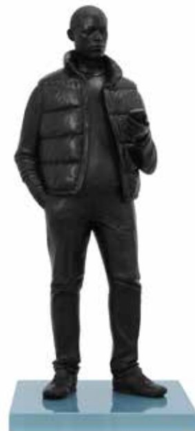
Tom Price, Network , 2012.

Born in London in 1981, Price studied at Chelsea College of Art and the Royal College of Art Sculpture School. In 2009 he was featured on BBC Four television documentary, Where is Modern Art Now? and was awarded the Arts Council England Helen Chadwick Fellowship. In 2010 he featured on BBC Four's, How to Get A Head in Sculpture and was included in 10 Magazine's Ten Sculptors You Should Meet .