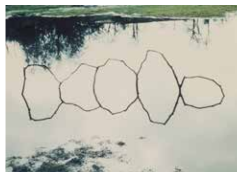
Andy Goldsworthy, Forked Twigs in Water , Bentham, 1979. Arts Council Collection, Southbank Centre, London © the artist

Bristol-based illustrator Tom Frost takes inspiration from YSP in 2014 to create new work including limited edition screen prints, ceramics and homeware, inspired by the Park's historic landscape and wildlife, all of which is available to buy. Frost studied illustration at Falmouth College of Art, graduating in 2001. His work is inspired by his passion for old matchboxes, vintage tin toys, folk art, children's books and stamps.