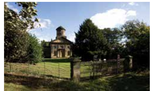
YSP Chapel.