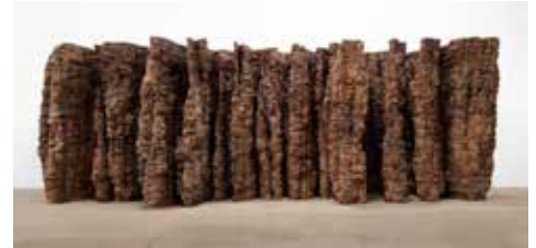
Ursula von Rydingsvard, Blackened Word (2008). 6'9" x 20'8" x 6'6" © the artist. Courtesy Galerie Lelong, New York

The first large-scale survey in Europe by highly acclaimed American artist Ursula von Rydingsvard opens at YSP on 5 April 2014. The exhibition, which is the artist's most extensive to date, illustrates the full scope of von Rydingsvard's diverse practice, including more than 40 works of drawing and sculpture made over the last two decades, presented in YSP's purpose-built Underground Gallery and the open air.