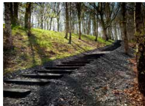
Seventy-one Steps , 2010

Coinciding with Uncommon Ground: Land Art in Britain 1966 – 1979 , David Nash returns to YSP in 2014 following his major 2010 exhibition at the Park. Two contrasting works, White Planting and Black Dome , overlook the Park's historic lakes demonstrating the artist's eloquent understanding of trees and the different properties of wood. Echoing Nash's famous Ash Dome , planted in 1977, White Planting comprises 49 Himalayan birch trees, which, planted in seven rows of seven, will grow to form a white cube on the lake's embankment. Referencing the natural cycle of wood, Black Dome is made from coal and charred oak. The work complements Nash's site specific Seventy-one Steps , a commission on the walking route to Longside Gallery.