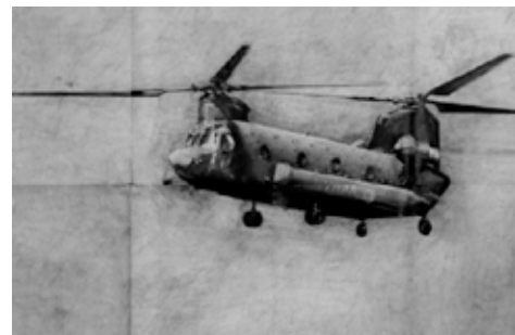
Fiona Banner, Chinook (2003). Pencil on paper and aluminium © the artist

Banner's practice, which encompasses sculpture, drawing, installation and text, demonstrates a long-standing fascination with the emblem of the fighter plane. She is well known for her early works in the form of 'wordscapes', written transcriptions of the frame-by-frame action in Hollywood war films, including Top Gun and Apocalypse Now . In 2004 she created an Airfix model archive of all the warplanes in service worldwide. Recent projects include 2013 solo exhibition The Vanity Press , at Summerhall, Edinburgh and Glasstress 2013: White Light/White Heat , a group exhibition at the Palazzo Cavalli-Franchetti in the Venice Biennale.