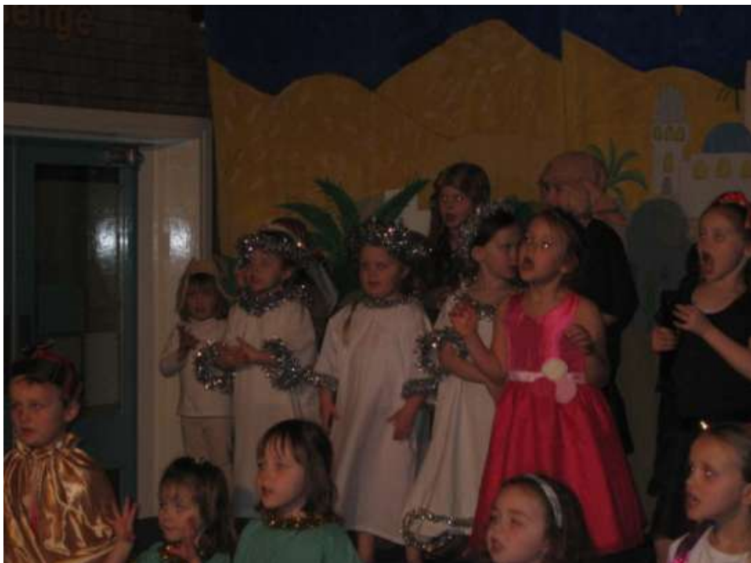
Jesus' Christmas Party – KS1 nativity