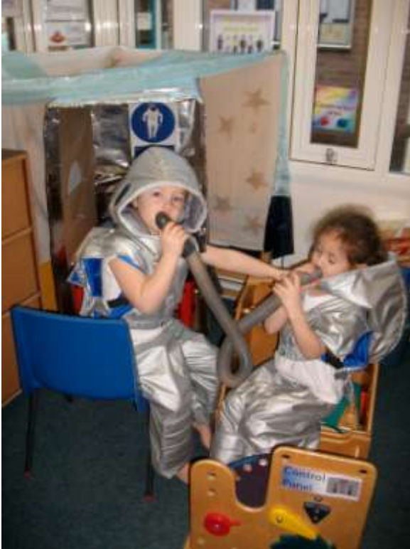
Astronauts and their spaceship in Class 1

Visits to the school are always welcome, or if you would like more information please feel free to contact us (01347 868371). Visit our new website on www.husthwaite.n-yorks.sch.uk