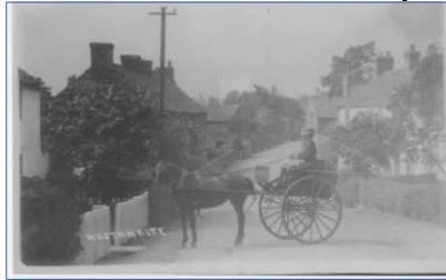
July Snapshot caption winner: John Ovenston Well ah can git through, but ah doubts thoo can