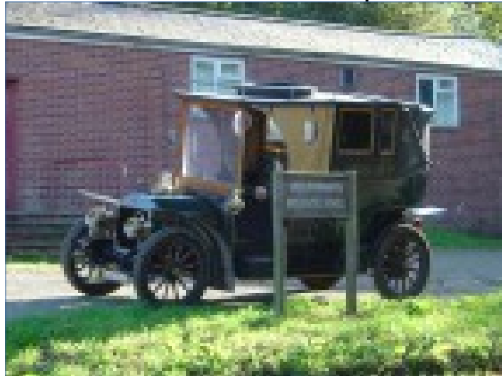
This motor car was seen outside Husthwaite Village Hall on Sunday 29th October 2006.

The owners, from York, were walking from Husthwaite to Sessay. He asked if it was OK to leave the car in the Village Hall car park. As the car was 100 years old, he didnt want to leave it parked in the road. I said the car was almost as old as the Village Hall! Gerald Crane