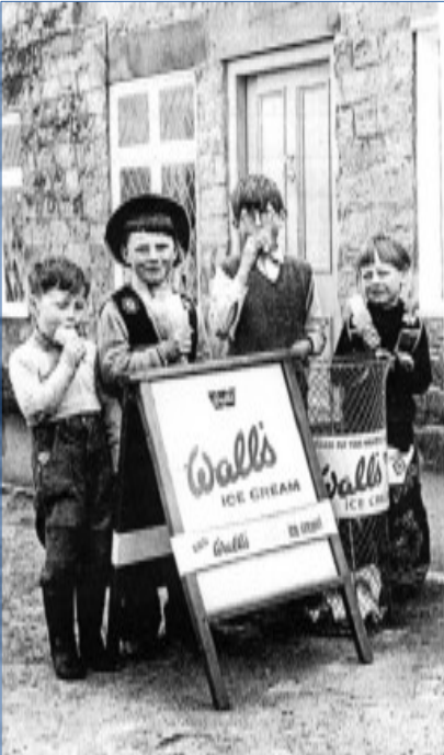
Husthwaite lads at Coxwold shop. Can you name all these familiar faces?

Angela is very grateful to all those who have spent time writing or relating their memories, sorting out photos to put the right names to faces on photos. This is the second of Reminiscences of Husthwaite, 1930s to 1970s to be published in the following few decades. These saw major changes in the village. New houses were built and old ones disappeared, a new school was built and the village was reorganised and people more mobile. Find out all about it in the new booklet for 5 (or order from me on 868347). The previous booklet was sold out in record time.