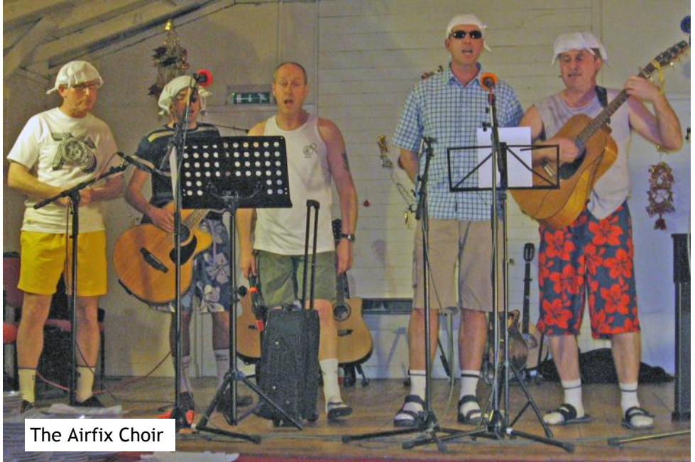
The Airfix Choir

Our Christmas event, 'Please Put a Penny in the Old Man's Hat', was a great success. Unfortunately, the event coincided with the Easingwold Singers' Christmas concert, so many of the village's most talented singers were not available. It was all the more remarkable, then, that the standard of the performances was so high and everyone had a lot of fun.