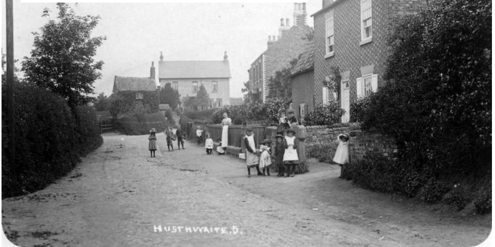
Pilgrim St, now The Nookin , in 1904, with Cote House (formerly the Post Office) on the right and, on the green, a small cottage.