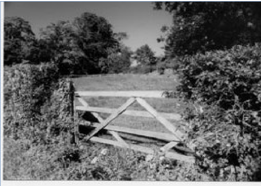
Summer Gate