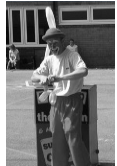
Boxo the clown at the Friends of Hustwaite School 20th birthday party